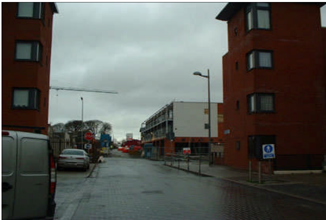
The Coultry Neighbourhood Facilities buildings (in the background) are due to be completed by Mid 2005.