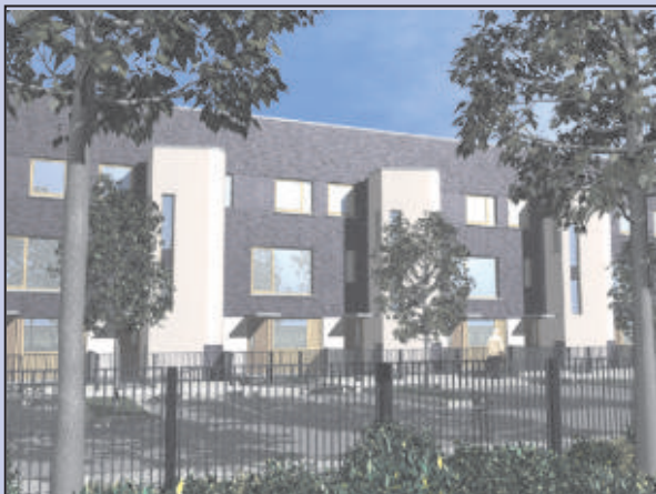
Balcurris 3 - O'Mahoney Pike Designed Dwellings