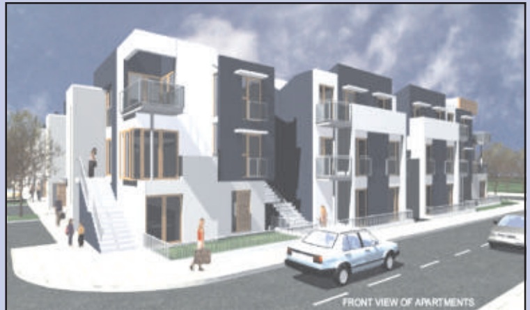
Balcurris 5 Dwellings and Boys Hostel